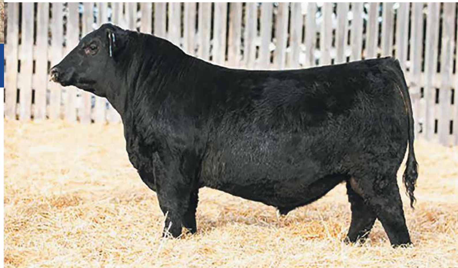
HF Hi-Country 7L 2024 Hamilton Farms Inc. Bull and Select Female sale High seller for $185000 CAD ($217800 AUD). Son of HF Tibbie 21J

“Common sense and cattle sense is the approach we use to breed top-quality lots for Annual Sale.”