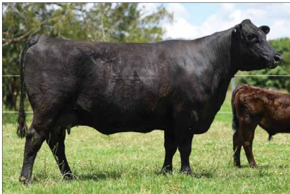
Pentire Laura M35, dam of Lots 4 and 10.

Pentire Angus Reference Sire HF Alcatraz 60F sold for $200,000 at the Hamilton Farms 24th Annual Bull Sale. He has been admired by all who have laid eyes on him, especially at the National Western Stock Show in Denver 2019 and 2020. Alcatraz has tremendous width in his top from behind his shoulders back to his pins and finishes off with a wide butt exhibiting excellent muscle shape. He has that proud herd bull look to his front end, lots of crest and power with a nicely shaped head accompanied by perfect feet and leg structure. 'Pentire Angus are excited for the future of our HF Alcatraz 60F progeny.' They are born quickly with extraordinary early growth until weaning lots of thickness carcass shape, and they look fantastic. Alcatraz is the most exciting sire introduced into the Pentire Angus program of recent times. He is going to have a significant impact on our program for a long time to come.