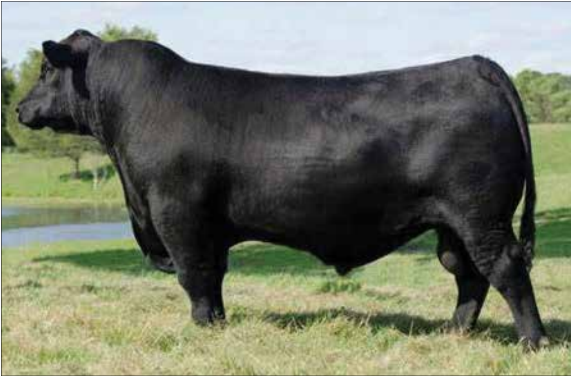
Schiefelbein Showman 338