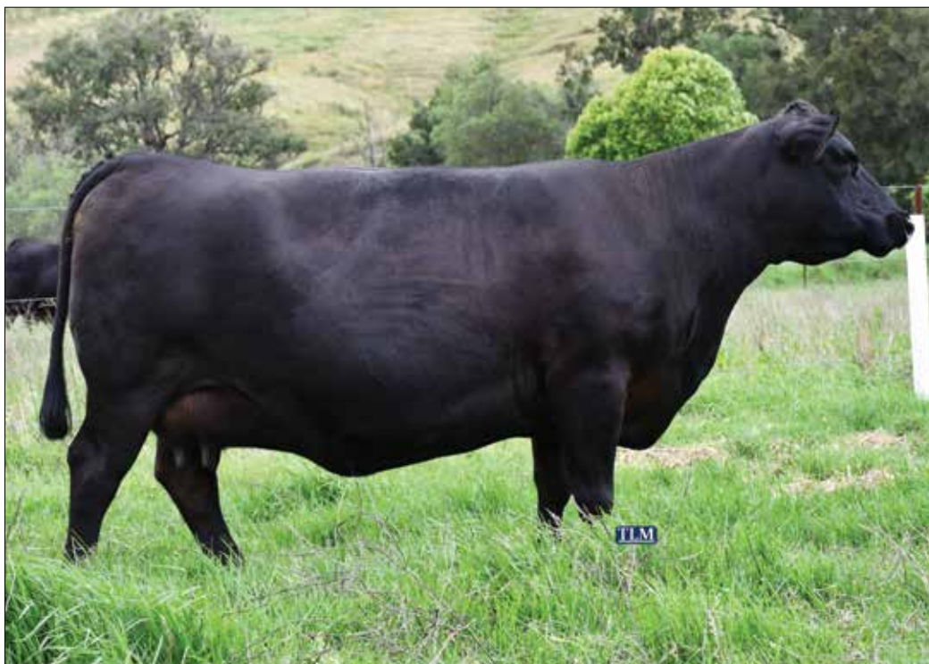
Pentire Pride H36, Dam of Lot 1.

as the potential buyers, can view them and notice their genetic merit to the fullest. Each one of our bulls are ready to go straight to work for you and your herd. Our Pentire Angus bulls will go out and breed phenotypically