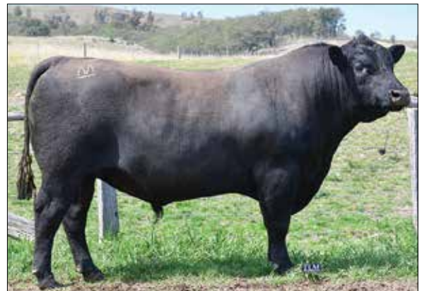
MILWILLAH ELSOM P184 SV

Daughters are very feminine and easy doing ability. Progeny is born early and exhibits thickness, softness, slick coated skin types. Very balanced and athletic with great feet and leg structure. Good toplines standing very square from behind, with good heads, broad muzzles, and well-hooded eyes.