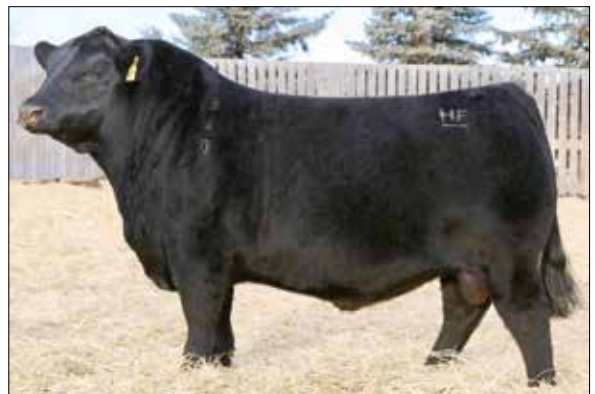
HF ALCATRAZ 60F#

Pentire Angus Reference Sire HF Alcatraz 60F sold for $200,000 at the Hamilton Farms 24th Annual Bull Sale. He has been admired by all who have laid eyes on him, especially at the National Western Stock Show in Denver 2019 and 2020. Alcatraz has tremendous width in his top from behind his shoulders back to his pins and finishes off with a wide butt exhibiting excellent muscle shape. He has that proud herd bull look to his front end, lots of crest and power with a nicely shaped head accompanied by perfect feet and leg structure. 'Pentire Angus are excited for the future of our HF Alcatraz 60F progeny.' They are born quickly with extraordinary early growth until weaning lots of thickness carcass shape, and they look fantastic. Alcatraz is the most exciting sire introduced into the Pentire Angus program of recent times. He is going to have a significant impact on our program for a long time to come.