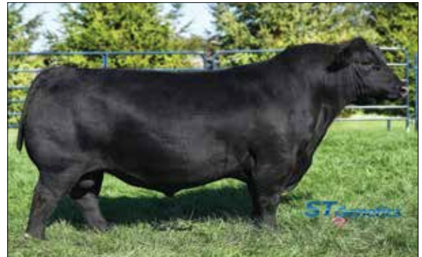
S POWERPOINT WS 5503 PV

S Powerpoint WS 5503 is an easy calving, early gestation sire with lots of thickness and power. They are also very slick coated cattle exhibiting lots of doing ability. Powerpoint has worked very nicely over the Pentire females. With 3 outstanding sons catalogued.