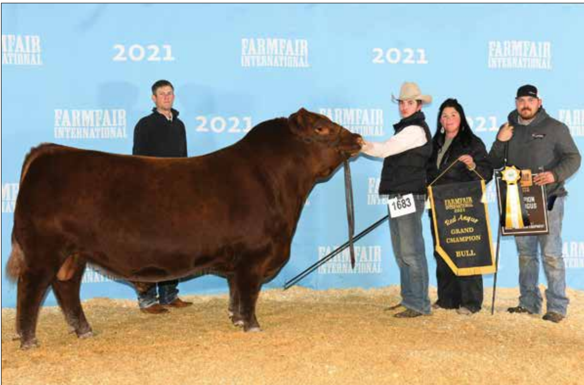
Red U2 Revival 147G